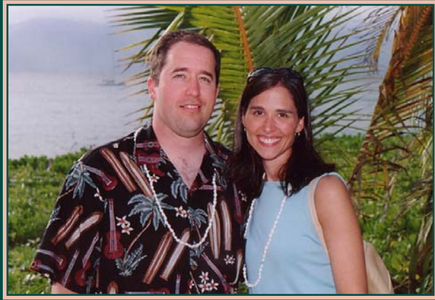
Maui Luau 2004