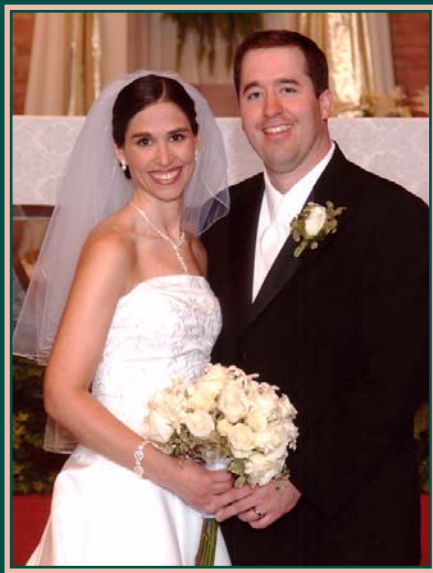
Our Wedding Day