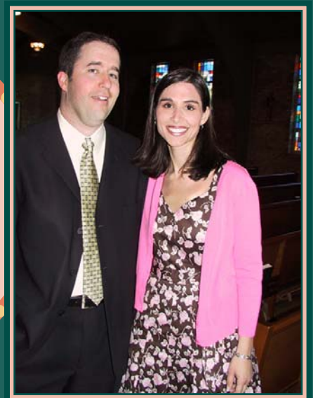
Wedding Rehearsal Dinner