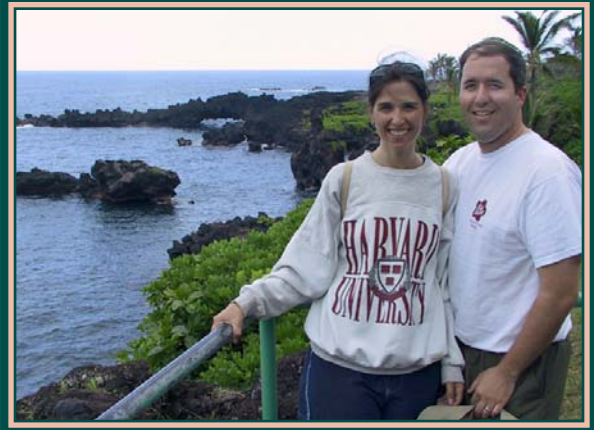
Black Sand Beach, Hawaii