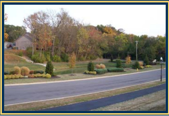
Backyard View in the Fall

The community pool, local schools, park and library are within a short 5 minute drive. The community park hosts outdoor movies which can be a lot of fun on a warm summer night. We live in a house with 4 bedrooms and 3 bathrooms. The bedrooms on the second floor are currently being used as the master bedroom, guest bedroom, study and, for the last couple of years, a nursery. We live just between each of our extended families which is a prime location for us, being within 15 minutes from each of our jobs.