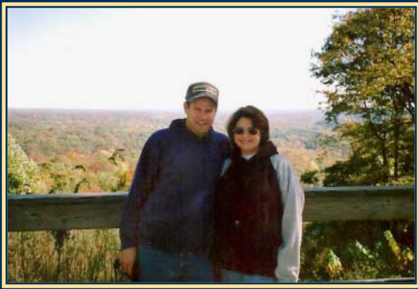
October in Brown County, Indiana