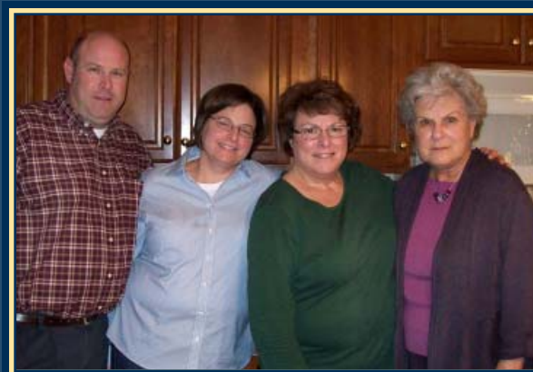
Visiting with Mom and Grandma