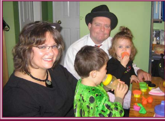
Rich with Our Friend and Our Friend's Kid at the Halloween Party

The town we live in provides lots of things to do and places to go, including public pools, ice cream shops, parks, as well as gymnastics and recreational centers. Our community provides many activities for children, including park activities at which they provide live music, ice cream, and games for kids. There is also a zoo, museums, nature trails, botanical gardens, amusement parks, and other fun places to go within a short drive from our house.