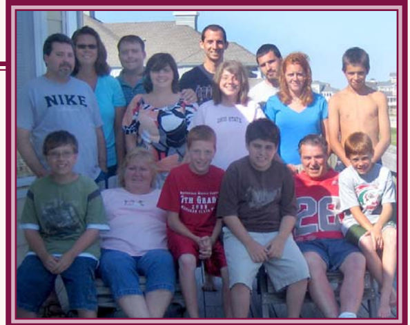
The Whole Family on the Deck of the Beach House Where We Stayed in North Carolina

We frequently get together with family and friends, and enjoy playing both inside and outside games with them. Cookouts are one of our favorite things to do when the weather is nice. We like to have a fire out on our friends or family member's deck or patio and make s'mores. We also like to have cornhole tournaments. :) Just being together is something that all of us feel thankful for. We also love to have our family and friends over for holidays. It is so much fun for us to cook a big holiday meal, and share wonderful memories with our loved ones. We are so looking forward to sharing these good times and memories with a child we have welcomed into our lives and into our hearts.