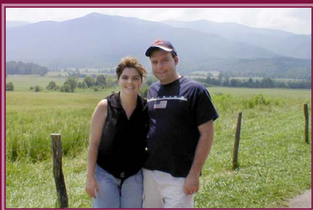
At Cades Cove in Tennessee Near Gatlinburg Where We Rode Horseback