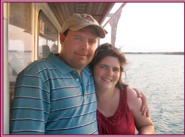
Enjoying a Sunset Boat Cruise in North Carolina