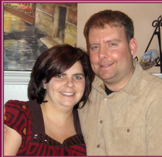
At Our House on Thanksgiving Day