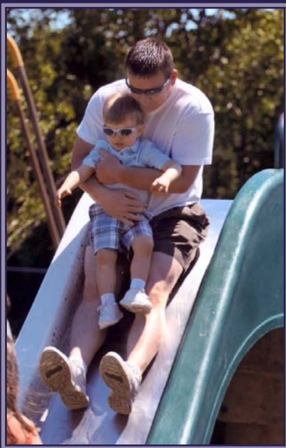
Fun at the Park