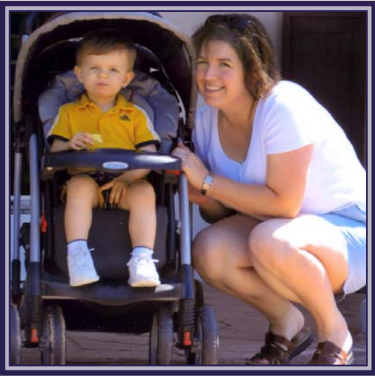
A Day at the Zoo

The new house is beautiful, located in a safe, family-oriented neighborhood in a suburb of a large city in Ohio with an excellent school system. We've had the opportunity to meet some of the neighbors, and everyone is very welcoming and friendly. We've seen a lot of strollers and kids playing outside, so we know that our children will have a lot of opportunity to build friendships close to home. The home allows for our children to have their own rooms, as well as a great big yard to play in throughout the year.