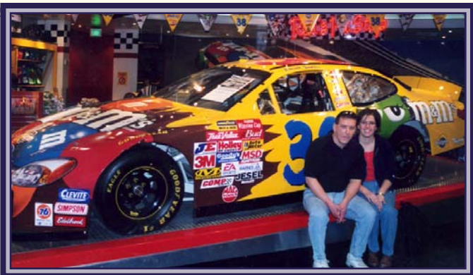
The M&M's Store in Las Vegas, NV