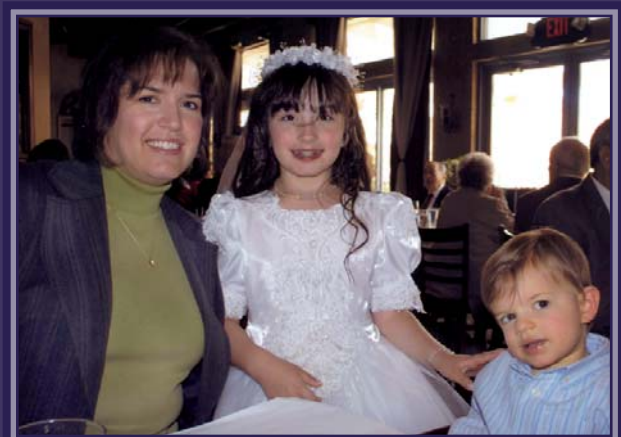
Our Niece's First Communion