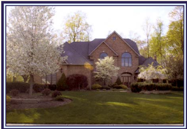
Our New Home