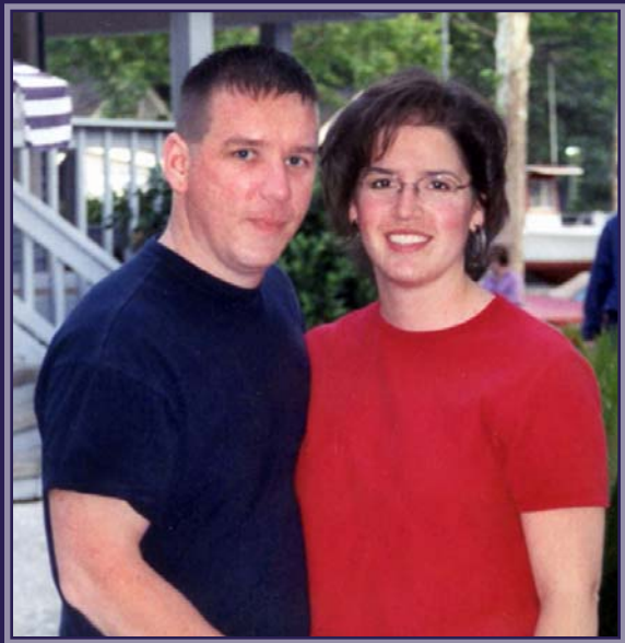
Vacationing at Hilton Head Island, SC