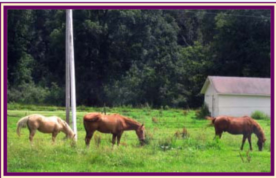
Family Horses Seen From Our Front Yard