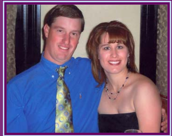
An Evening Out