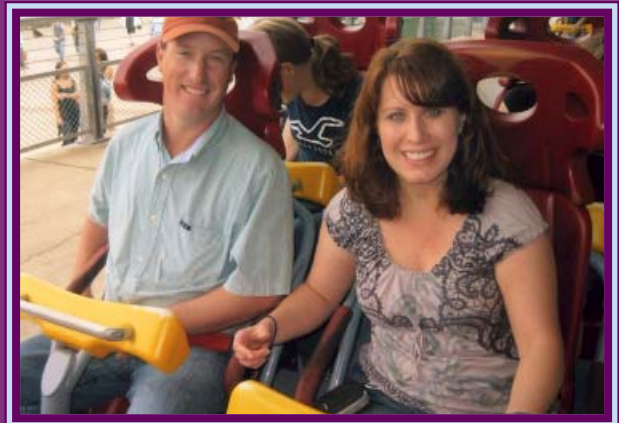
Fun at Cedar Point