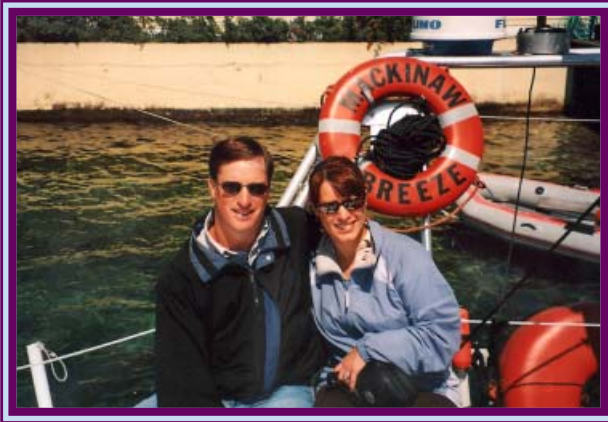
Macinac Island Vacation