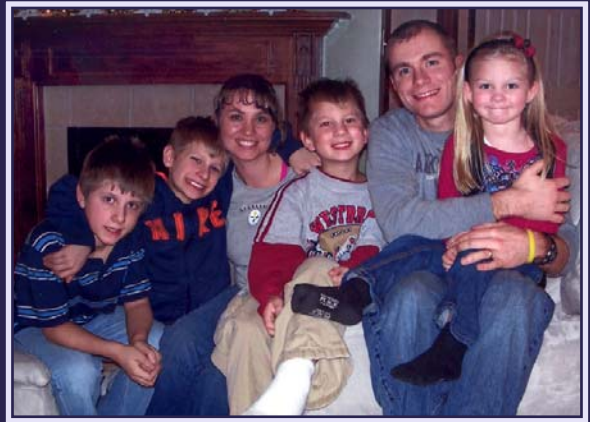
With Our Little Cousins at a Family Gathering