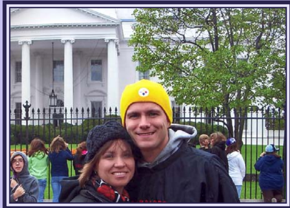
Our Middle School's Trip to the White House