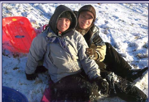
Sledding at a Friend's House