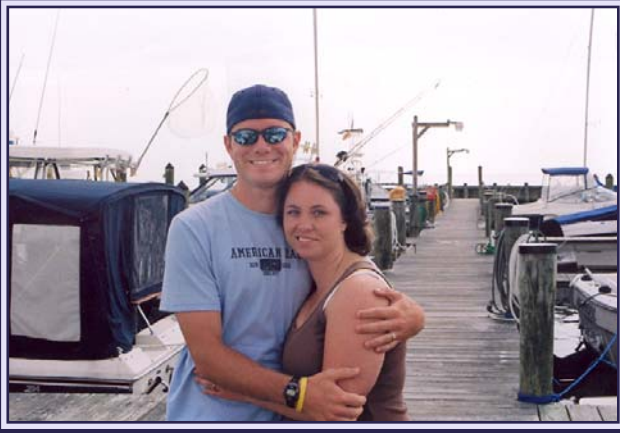
On the Fishing Boat in North Beach