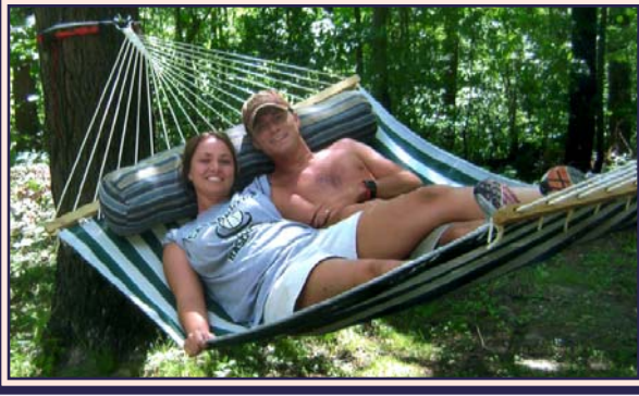
Camping at a Local Campground

We love our community because of its rural and farm setting. It gives us the safety and slow pace life that only a small town can offer. With the annual County Fair, Rib Burn Off at the small airport, and holiday and school parades, we are part of a close community. Our community offers a YMCA, the Community Pool, and a local state park lake for family fun. Our community school is rated as a Highly Effective School District. The elementary, middle, and high schools are located on the same street near our public library. Along with the small town qualities, we still live in driving distance of larger towns that provide other resources, activities, and opportunities for our family.