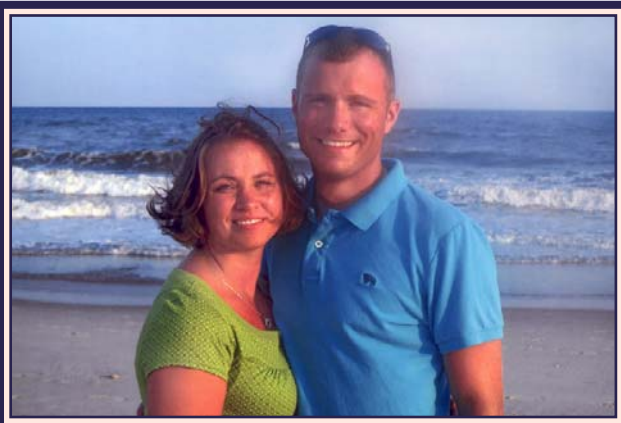
Vacation at Holden Beach, North Carolina

Vacations and family trips give us many fantastic family memories to last a lifetime. Our family enjoys visiting many different places together. We definitely love to vacation at the beach. Two of our favorite vacation spots are the Outer Banks and Holden Beach in North Carolina. We enjoy soaking up the sun, walking on the sand dunes, collecting sea shells, and visiting aquariums full of sea life. We have many "intense" games of bocce ball on the beach. At night, we laugh and eat while playing card and board games. We also like to take our flashlights out on the beach at night as the kids chase crabs across the sand. These places give us the opportunities to enjoy a week of relaxation with our friends and family.