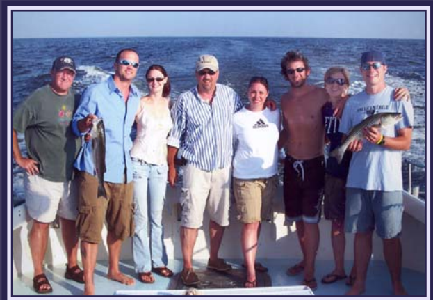
Fishing on the Chesapeake Bay in Maryland with Family