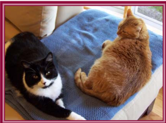
Bruce and Emily Relaxing on the Couch