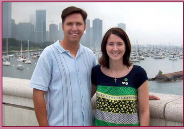
On Vacation in Chicago