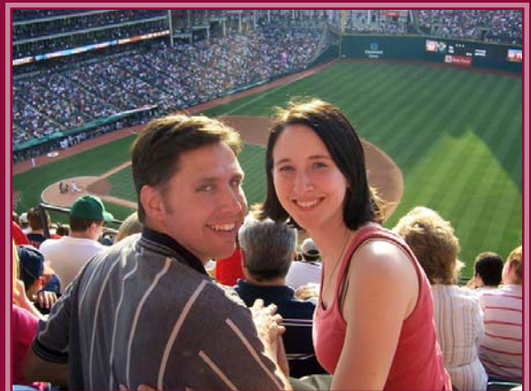
A Sunny Day at a Baseball Game