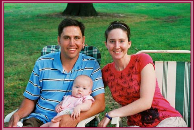
Enjoying a Day at the Park