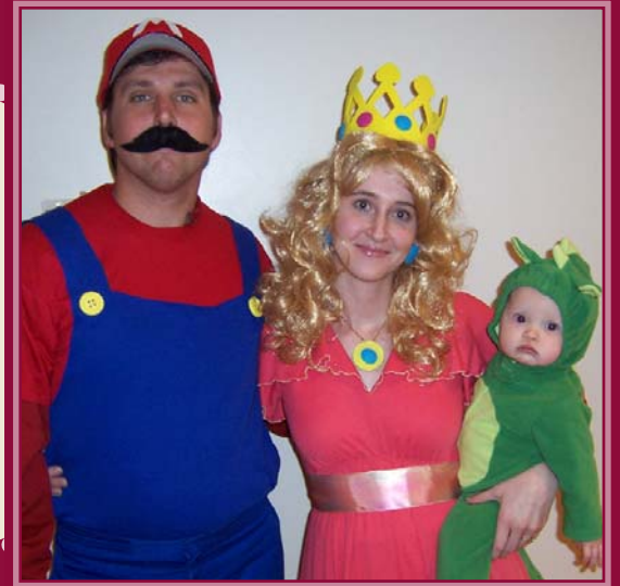
Dressed as Mario Brothers Characters for Halloween