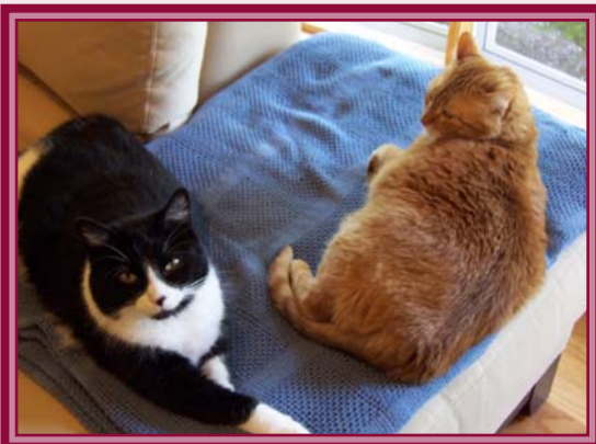
Bruce and Emily Relaxing on the Couch