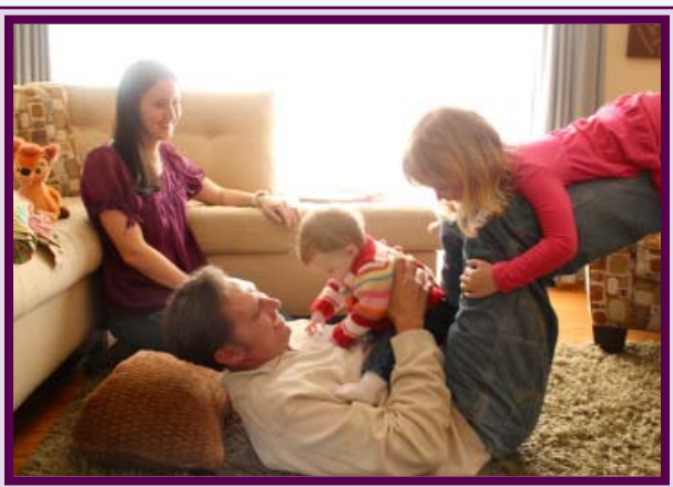
Playing in Our Living Room