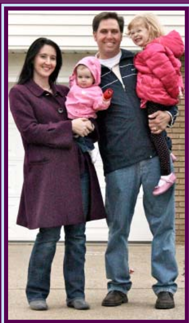
In Front of Our Home