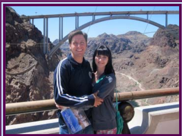
Sightseeing at Hoover Dam