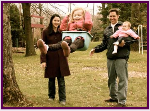
Playing Outside in Our Yard

Our community is small, but also not far from the major city in our area. We have a park and playground, a community recreation center with a kid-friendly pool area, and lots of shops and restaurants just up the street from us. It's really convenient to find things to do together as a family. Our neighbors are very friendly and kind, and our neighborhood has several young families with children. As for schools, Elizabeth is enrolled in the preschool at our parish. We plan on giving all our kids a Catholic education.