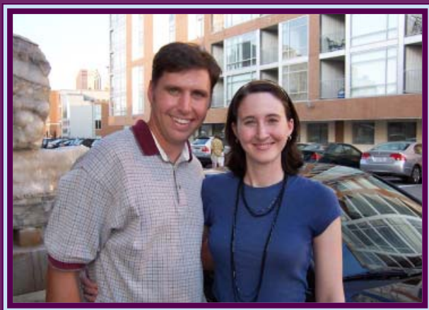
Hanging Out Downtown