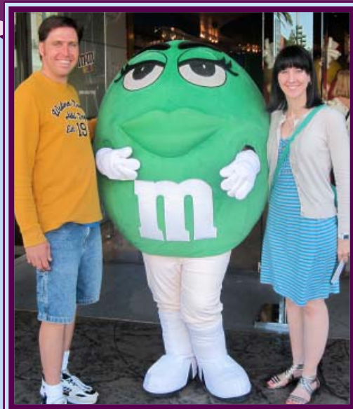
With an M&M in Las Vegas