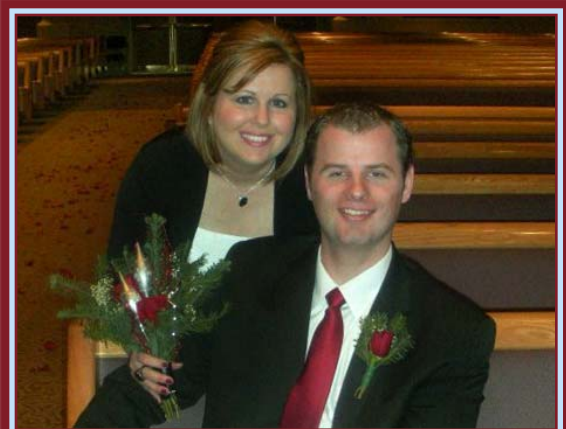
At April's Sister's Wedding