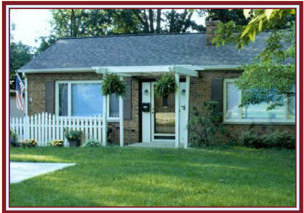
Our Adorable Home

Our HOME is a 3 bedroom, 2 bath ranch that we bought in the fall of 2006. It is an adorable home located in the MetroParks area. We are near 3 lakes and miles of walking, biking and horse riding trails. We spend most of our summers outside in the parks. It is a beautiful place to live, and we wouldn't trade it for the world. We have been busy painting a nursery and turning a bonus room into a child's play room. We are so excited about opening our home to a new baby.