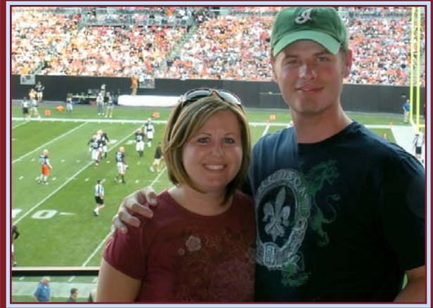
At an NFL Football Game