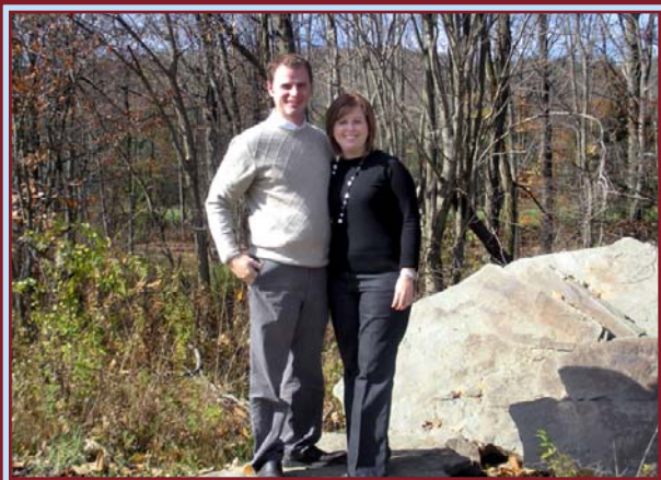
In the Mountains of Upstate New York