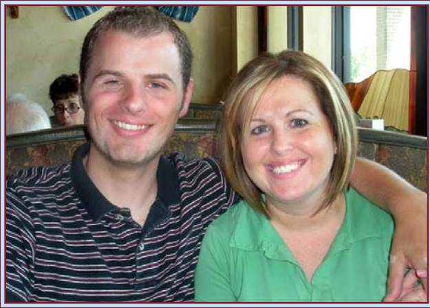
At Our Favorite Mexican Restaurant