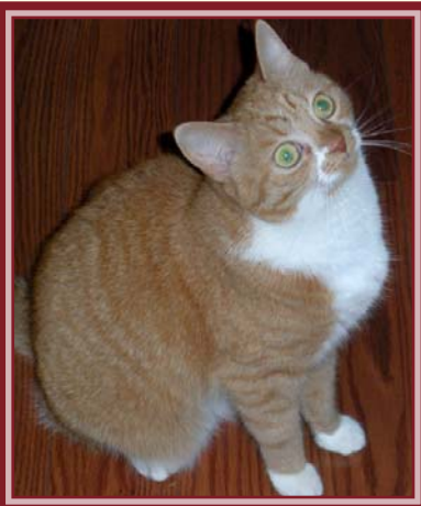
Our Cat "Chicken"

We are animal lovers! We have such a love for all animals and wish we could adopt them all! We have a 1 year old yellow Lab named "Jody" and a 3 year old yellow Tabby cat named "Chicken". Our pets are so cute and we enjoy playing and entertaining them. (In reality, they really entertain us!)