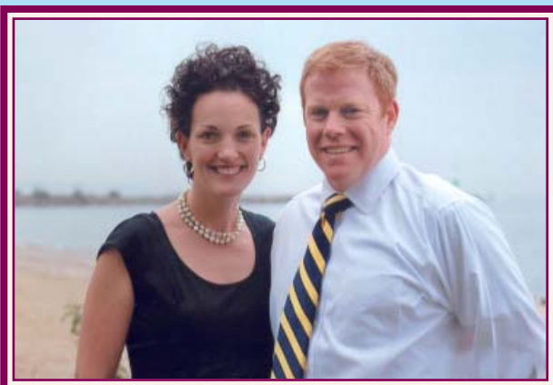
At a Family Wedding