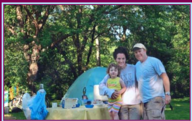
Camping in New York