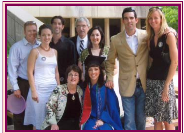
Kate's Sister's Graduation