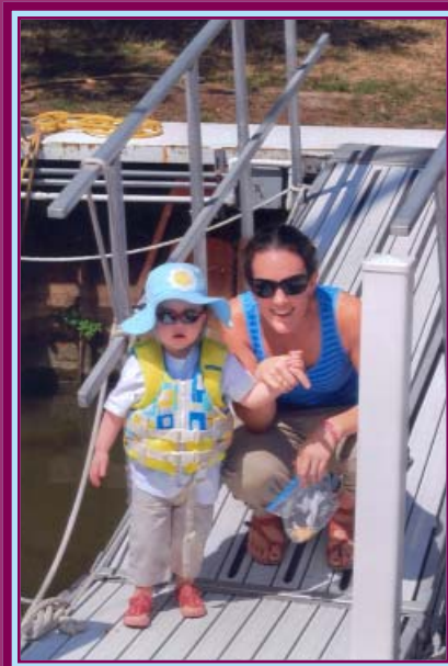
On the Boat Dock