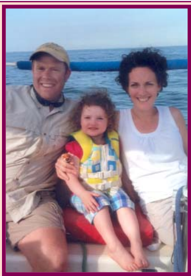
Sailing On Our Boat