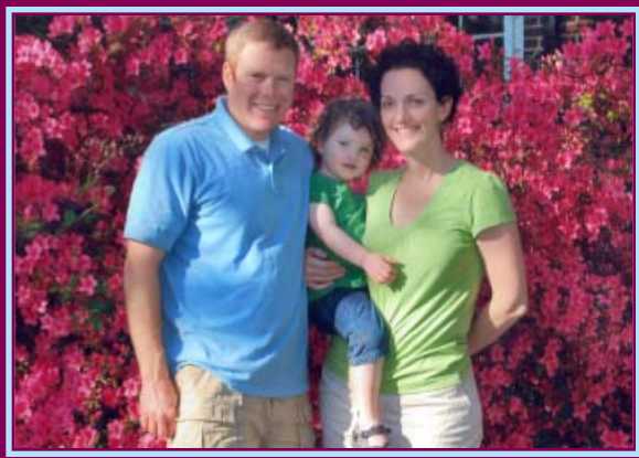
Our Yard in Bloom