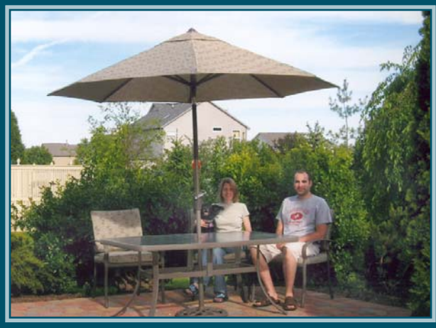
With Our Dog Leah in Our Back Yard