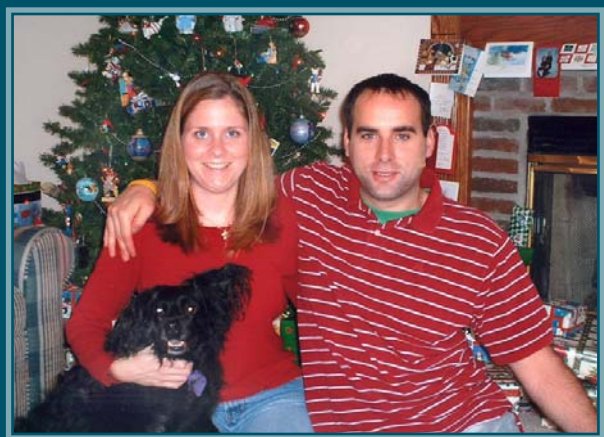
Christmas with Our Dog Leah