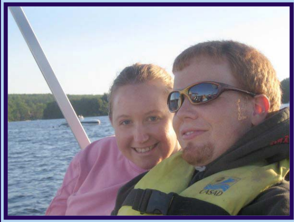
Out on the Lake Boating