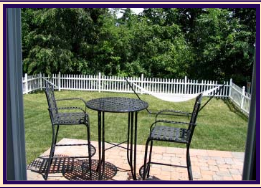
Back Porch and Yard

Our home is an 1800 square foot house with three bedrooms. We have a fenced-in back yard and small salsa and herb garden. We enjoy grilling on our patio and laying in our hammock in the back yard. Our neighborhood has a playground within walking distance, and a walking path and pond behind our house.