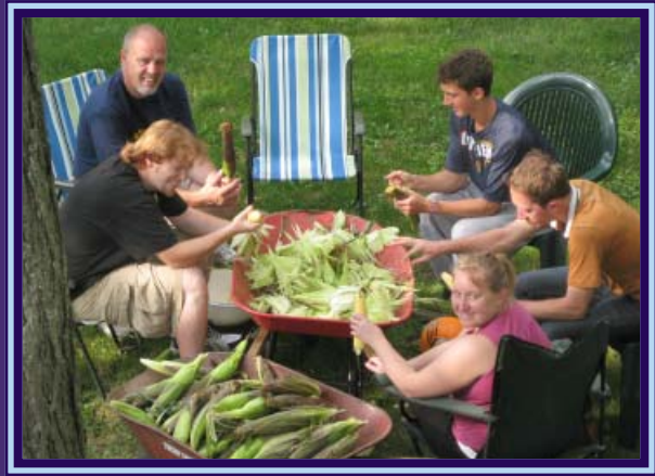
Husking Corn with Family