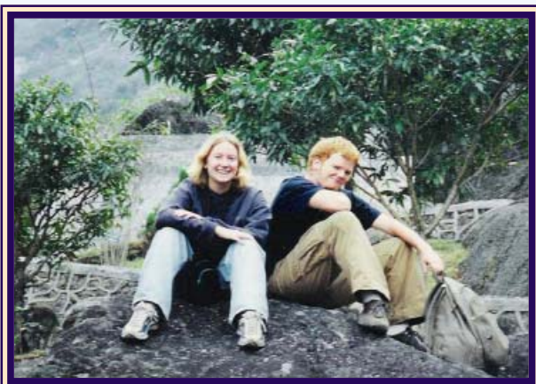
Enjoying the Sights in India

We enjoy learning and experiencing new things and believe in the importance of being exposed to the differences in the world. We regularly attend cultural festivals such as Irish Festival, Oktoberfest, Asian Festival, International Festival, etc. Our time living overseas opened our eyes to the beauty of other cultures and gave us a desire to learn more about them.