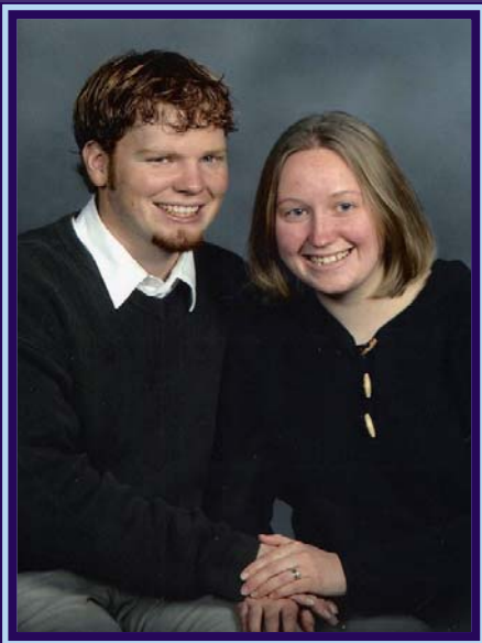
Our Church Photo